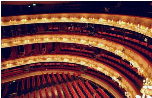
ROYAL OPERA HOUSE

London has and will always be one of the most luxurious places to visit and live in United Kingdom. Through time, it become among the most expensive places in the whole world. With the metropolitan section measuring 3000 square miles and housing more than thirteen million individuals, the city apparently rivals New York City in United States. Considering the fact that this place is small, there is no enough space to put great desirable places. Nevertheless, London is still able to offer locals and visitors countless luxury things to do in the city.